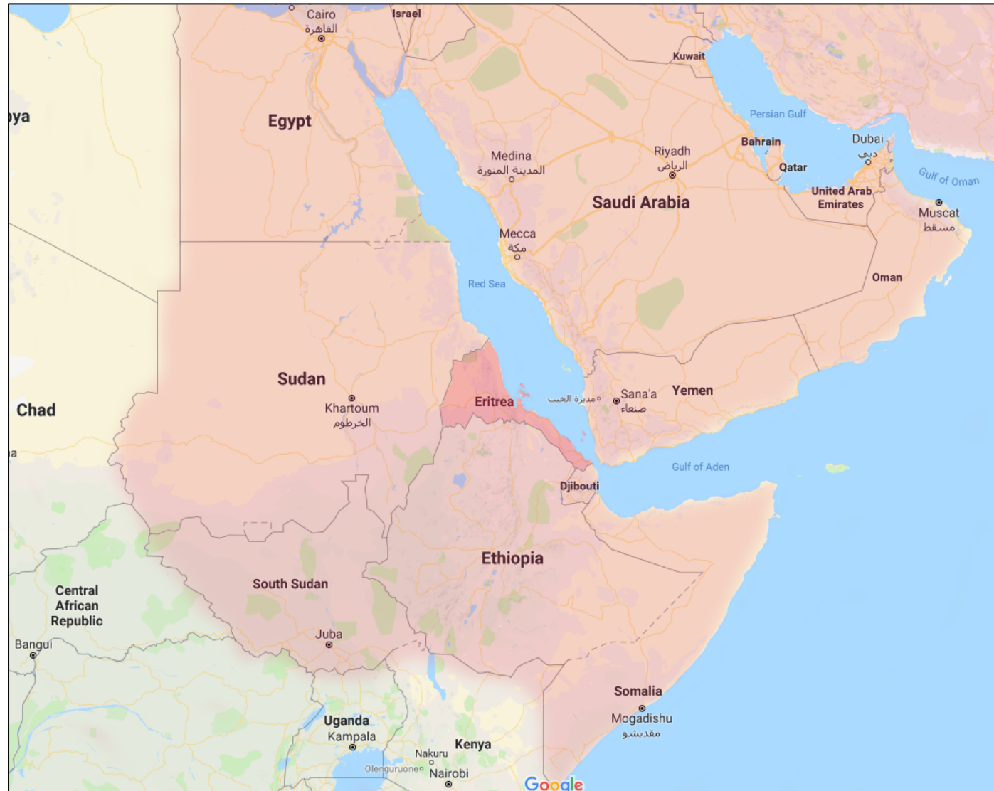
The Horn of Africa and Arabian Peninsula